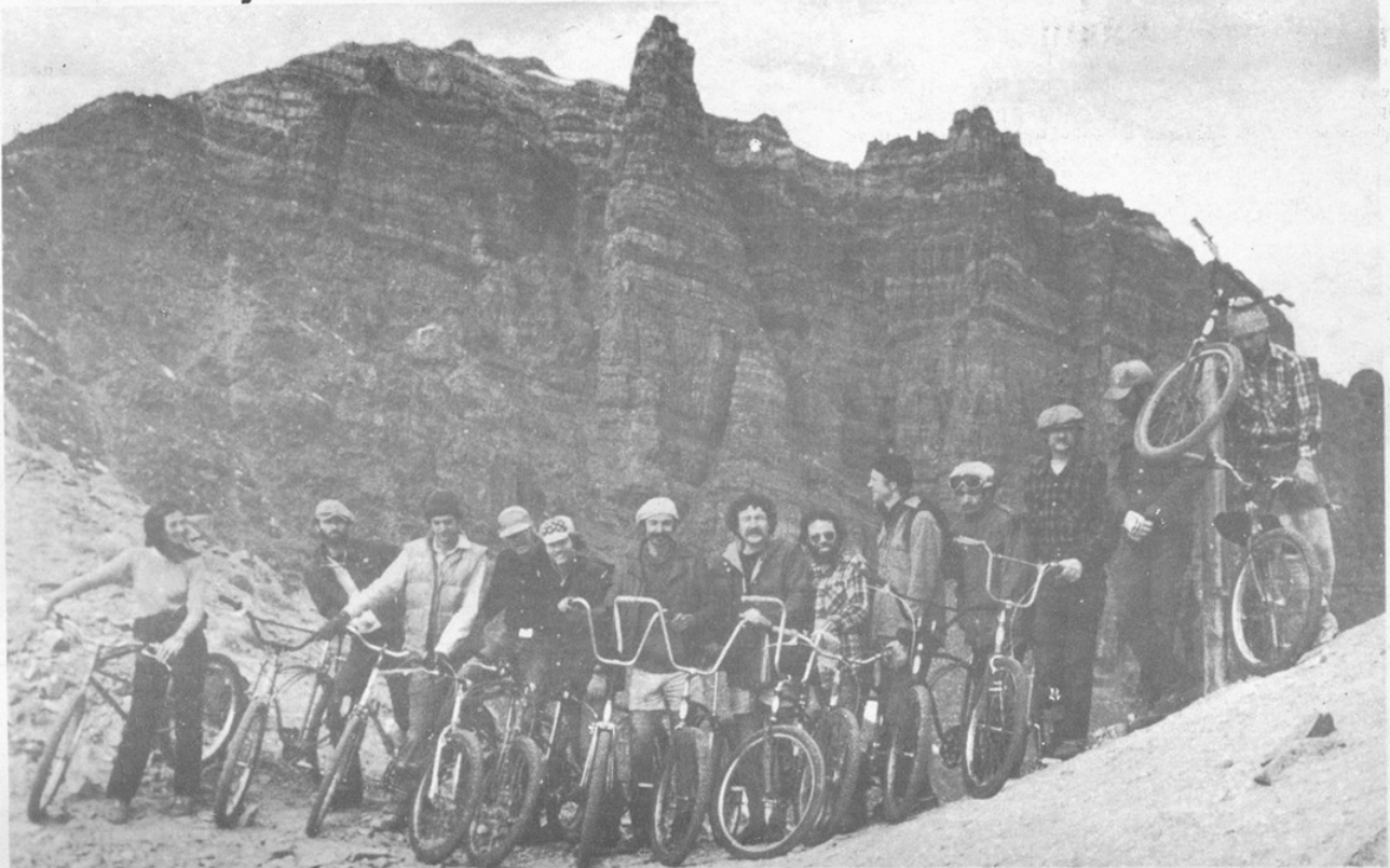
The grande portrait of all the Crested Butte and Marin County die hards atop the dreaded Pearl Pass. Rumors had it that a few Aspenites riding motorcycles ran across the crazed bikers and could not believe it was possible.