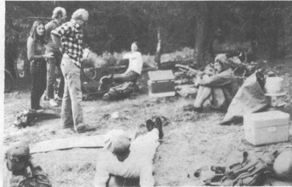
Klunker bedded down for the night, riders prep their tents for a good night's rest.