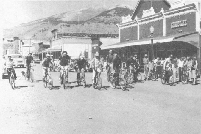
Sunny Saturday the photo start in front of the Grubstake shows the avid klunkers on their way up the rough, long haul toward Pearl Pass.