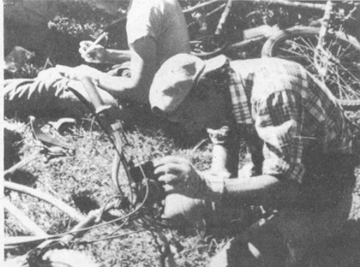
The California contingent, who had written the Grubstake for months in advance concerning the famed Pearl Pass truck, brought a bit of sophistication to the race, including a mounted camera on the handlebars.